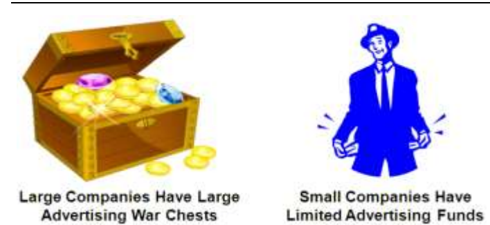
Lack of a large advertising war chest can break a business

No matter how great your product, service, or business idea is, it will not make you any money if it is not properly marketed. But marketing can be very expensive! For example, Google Ads can cost you 1 to 2 dollars per click. And you must market to get the sales that allow your company to survive, grow, and advertise even more to keep the cycle going. This puts every small and home-based business with limited funds in a dilemma. So, the question is: "How can you market your products and services to get the sales needed to turn a profit without having a large war chest to pay for the advertising in the first place?" The answer: Classified Ads! If done correctly, classified ads can provide you with a means to advertise on a shoestring successfully!